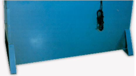
DLS 26, DLS- 36